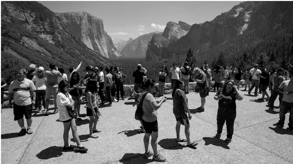
Large crowd gathers at Tunnel View-Yosemite.