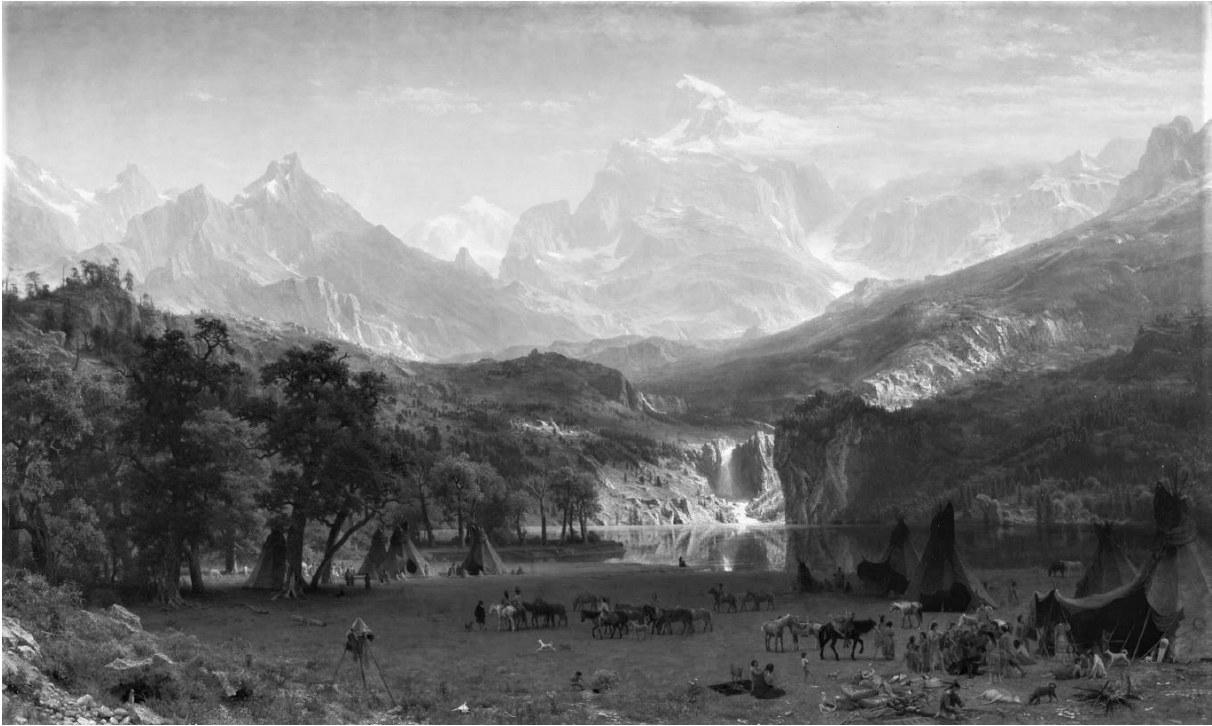
Albert BIERSTADT, The Rocky Mountains, Lander's Peak , oil on canvas, 1.87 x 3.07 m., 1863, Metropolitan Museum of Art, New York.