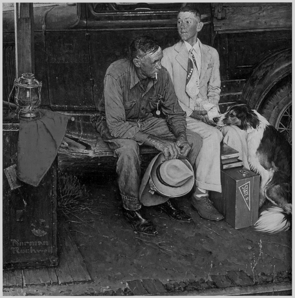
Norman ROCKWELL, Breaking Home Ties , September 25, 1954