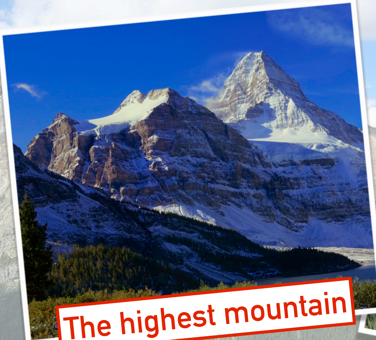
The highest mountain