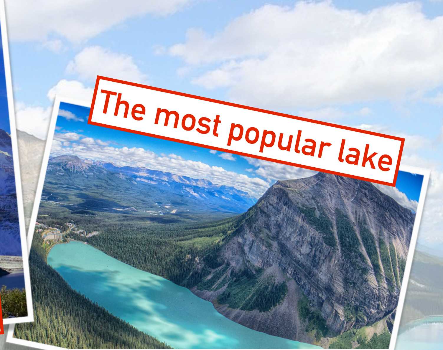
The most popular lake